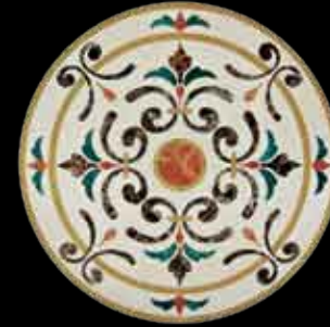
THE PROVENCE MW-13