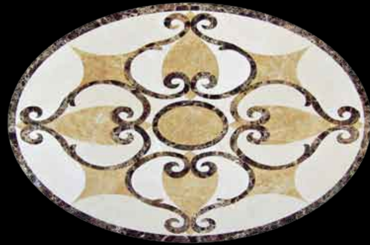
THE JEWEL MW-100-OVAL