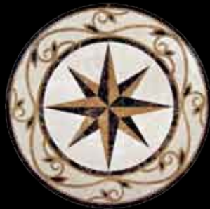
THE NORTH STAR MW-01

AVAILABLE SIZES: 36", 48", 60", 72" SOME DESIGNS 96"