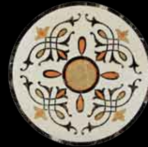
THE MILANO MW-14