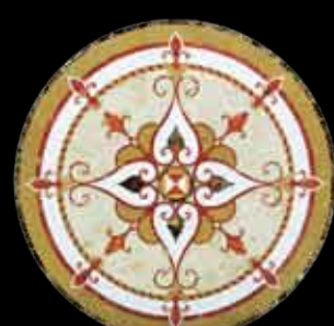
THE NAPLES MW-12