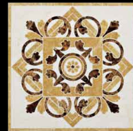
THE EMPEROR MW-201SQ