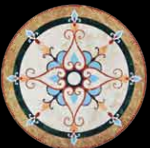
THE ITALIANO MW-11