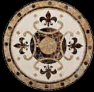
THE ORLEANS MW-07