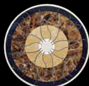
THE MYSTIQUE MW-21