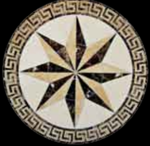
THE TAO MW-08