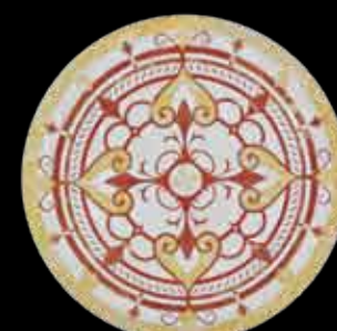
THE GRAND MW-19