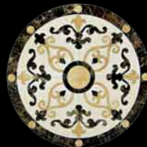
THE MARCOS MW-09