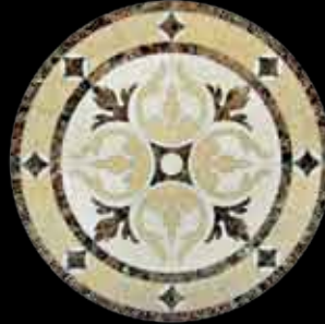
THE RENAISSANCE MW-06