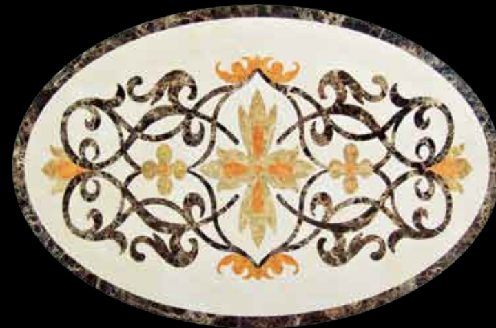
THE VICTORIAN MW-101-OVAL