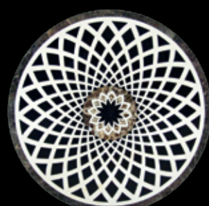
THE IMPERIAL MW-20