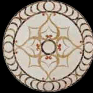
THE PRINCESS MW-02