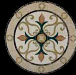
THE FLORENCE MW-15