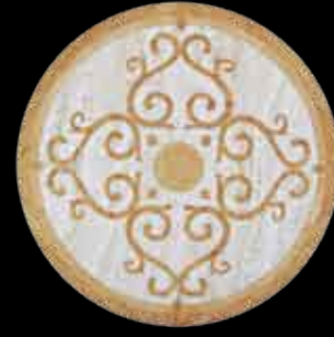
THE ROMAN MW-04