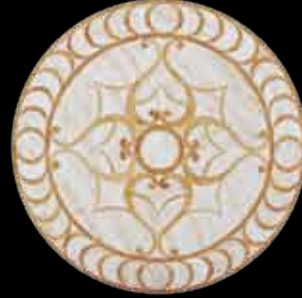
THE QUEEN MW-03