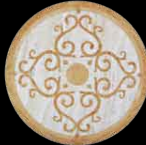
THE CROWN MW-05