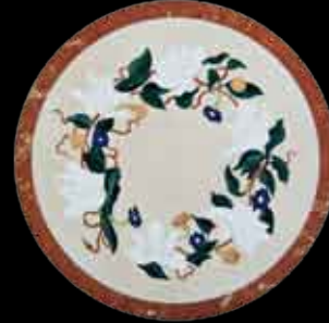
THE FLOWER MW-17