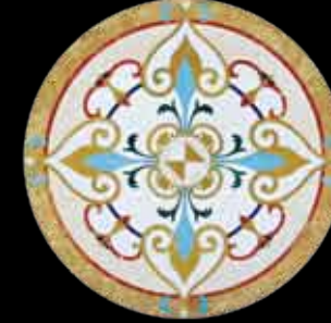
THE CALABRIA MW-16