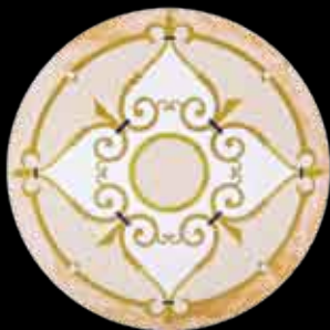
THE AMERICAN CLASSIC MW-10