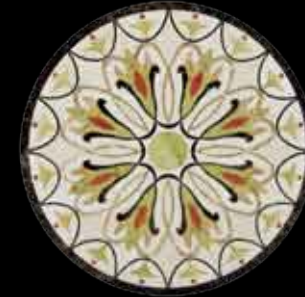
THE LILLY MW-18